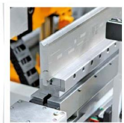
Wila Bottom Tool Clamping System (O)