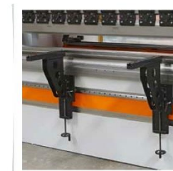
Sliding Front Support Arms (S)