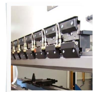
Hydraulic Tool Clamping System (O) Hydraulic tool clamping systems clamp, correct and centre the tools automatically without need for air. These are perfect solutions to shorten the setup timing and for automated press brakes.