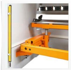
C 2000 Rear Light Guard (S) CE standards safety protections help you work in safer conditions.