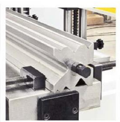
Multi-V Bottom Tool (O) Multi V or U type adjustable tools.