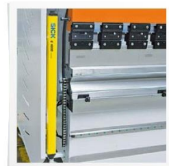
SICK Light Barrier (S)