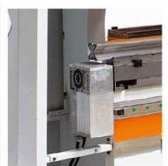
CNC Motorized Crowning System (S) CNC crowning system that communicates with the CNC controller, performs crowning automatically and enables the part to be at even bending angle at any given point.