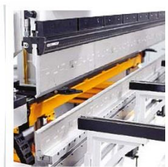
Wila Hydraulic Tool Clamping Systems (O)