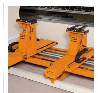
6 Axes Backgauge with Servo Motor (O) 6 axes (X1+X2+R1+R2+Z1+Z2) (O) rapid and precise back support systems with servo motor. They enable you to increase the production performance and quality.