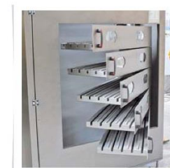
Tool Storing Cabinet (O)