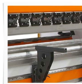
Promecam Top Tool Clamping System (S) Top tool clamping system which provides quick tool change.