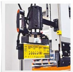
Fiessler Akas LCIIM Protection System (S)