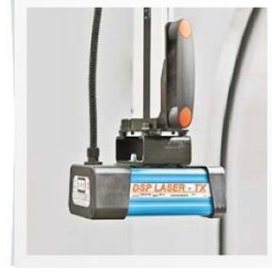
DSP Laser Protection System (O)