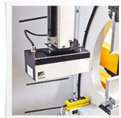
IMG 100 Laser Safe and Angle Measurement System (O) Laser Finger Protection helps you save time with easy installation. - Angle Measurement can be used with ER-80.