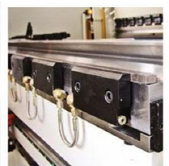
Hydraulic Bottom Tool Clamping System (O)