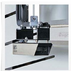
Laser Safe (O) Laser safe that is produced specifically for press brakes and is the leader among safety systems. Laser safe keeps the operator's safety at the top level.