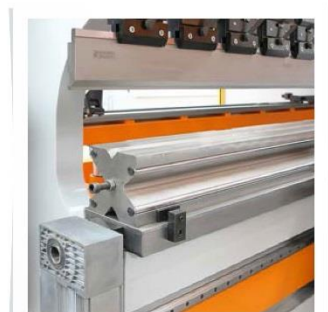
Throat (O) Special throat depths are offered up to 1500 mm for large bends.